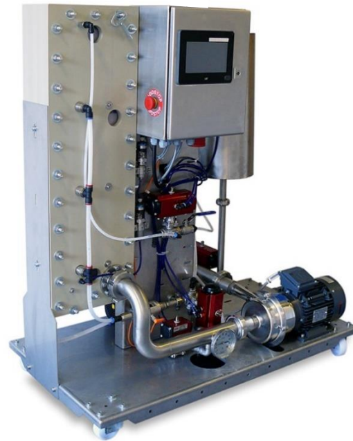
The Hollow Plate™ Pilot Element mounted in a MF/UF pilot plant